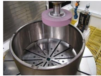
Typical on 700 or 1000 Model