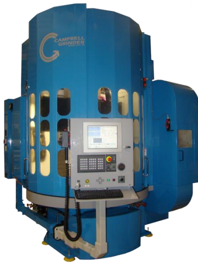
750 Model with Tool & Nozzle Changer