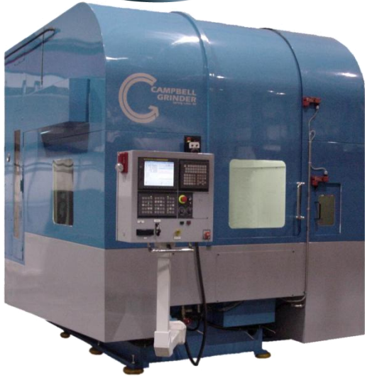
930 Model with Tool & Nozzle Changer