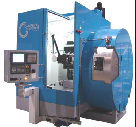
2000 Model with Tool & Nozzle Changer