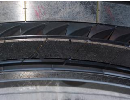
Typical on 750, 930, 1000, or 2000 Model